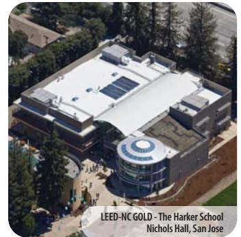
LEED-NC GOLD - The Harker School Nichols Hall, San Jose