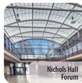
Nichols Hall Forum