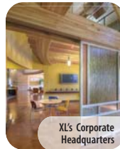
XL's Corporate Headquarters