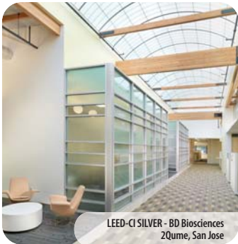
LEED-CI SILVER - BD Biosciences 2Qume, San Jose