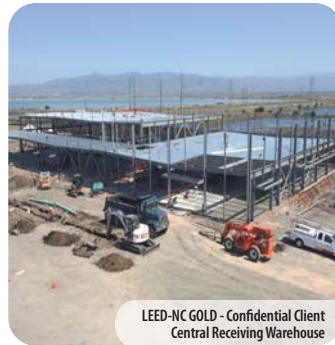
LEED-NC GOLD - Confidential Client Central Receiving Warehouse